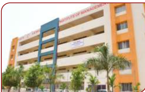
S.B. Patil College of Architecture & Design ( www.sbpatilarchitecture.com )