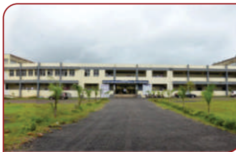
Nutan Maharashtra Vidya Polytechnic ( www.nmvpolytechnic.com )