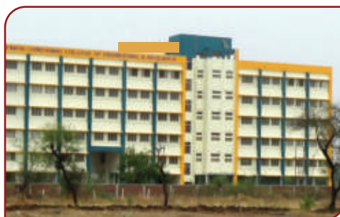
S. B. Patil College of Science & Commerce ( www.sbpatilcollege.com )