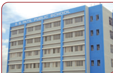
S. B. Patil Public School ( www.sbpatilschool.com )