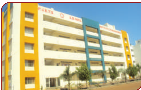
S. B. Patil Institute of Management ( www.sbpatilmba.com )