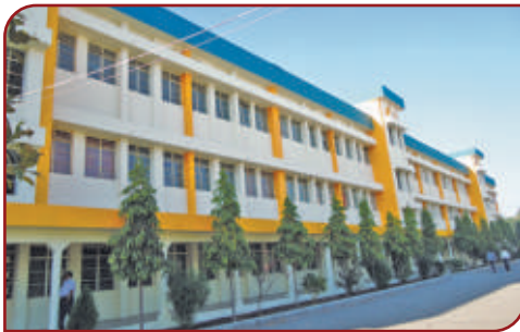
Pimpri Chinchwad Polytechnic ( www.pcpolytechnic.com )