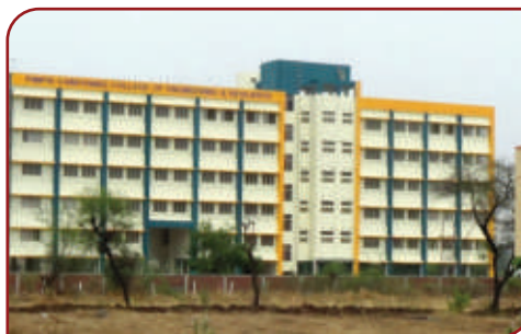
Pimpri Chinchwad College of Engineering & Research ( www.pccoer.com )