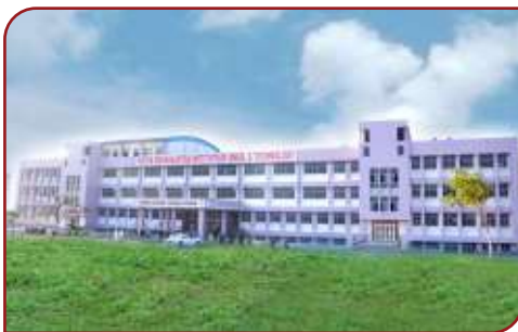
Nutan Maharashtra Institute of Engineering & Technology ( www.nmiet.edu.in )