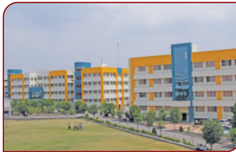
Pimpri Chinchwad College of Engineering ( www.pccoepune.com )