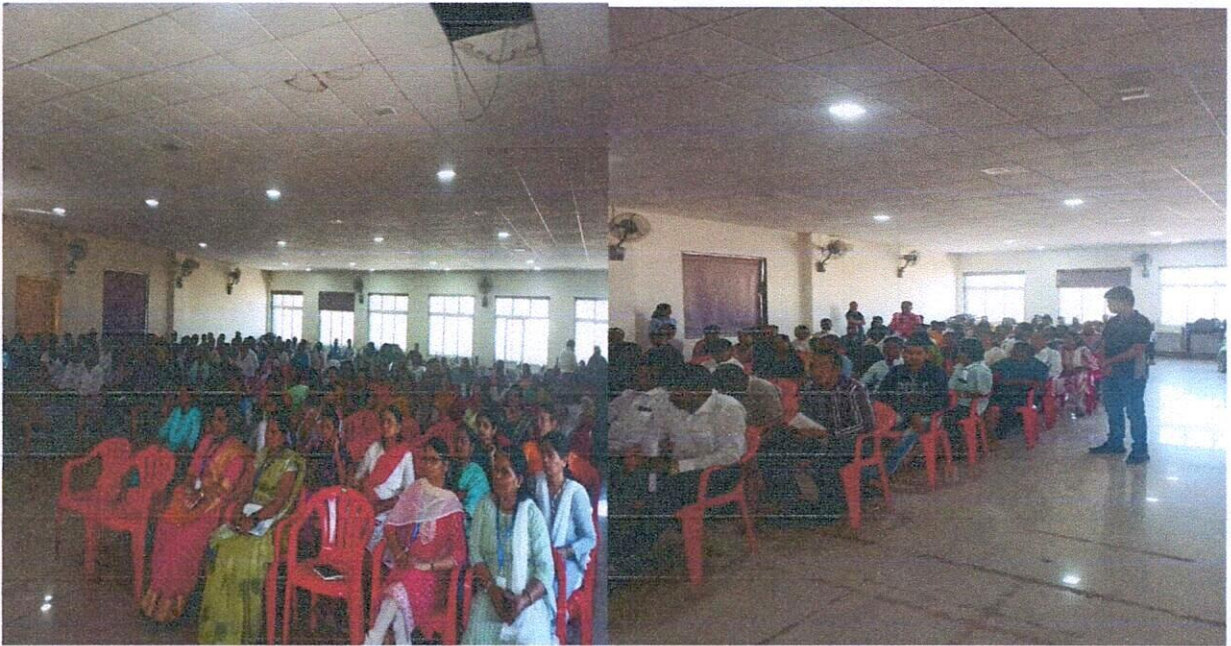
Date: 30/1/2020 Speaker: Alumni Association Activity Session: guidance session on higher education, group discussion and soft skill