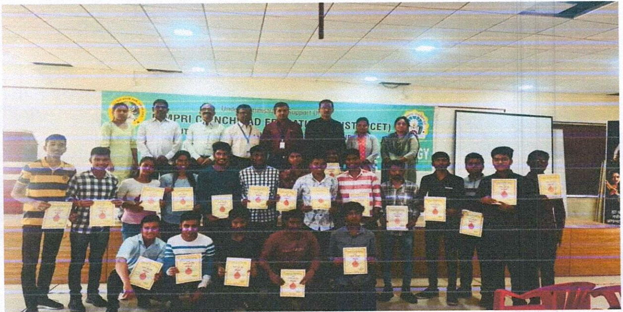
Fig: Blood donation camp certificate distribution