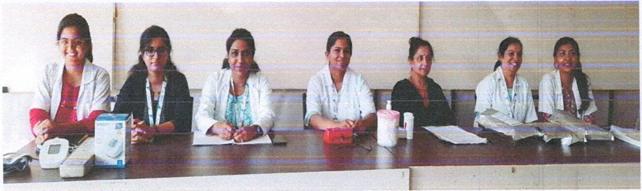
Fig: Blood donation camp with doctors