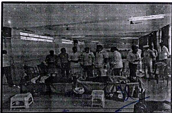
Fig: Blood donation camp visit by trustee members