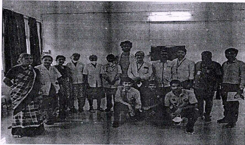
Fig: Blood donation camp with doctor team & volunteer