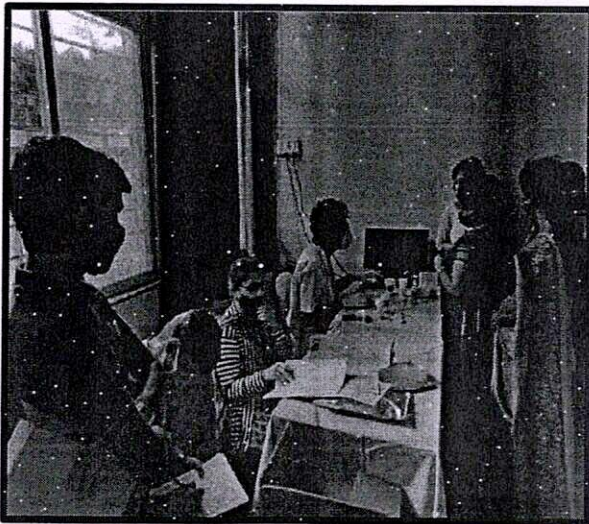
Fig: Blood donation camp with doctor team