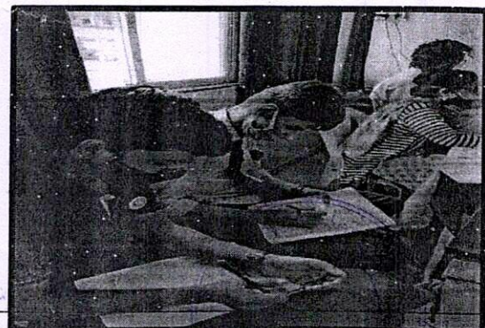
Fig: Blood donation camp

Handwritten text and stamp: Talegaon Dabhade, 410507 NMIET