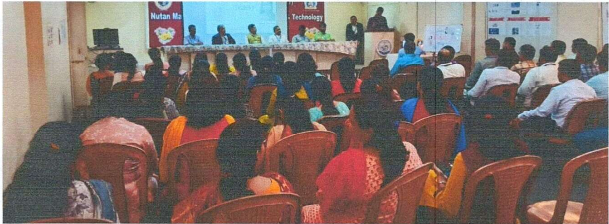
Fig.: Seminar On Research For Beginners