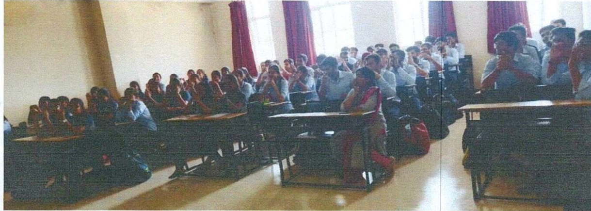
Fig.: Seminar On How to File Copyright and Patents