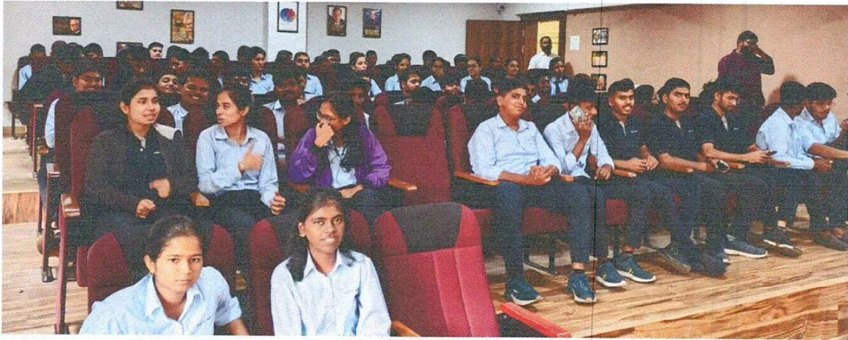
Fig.: Seminar On How To Write Research Paper