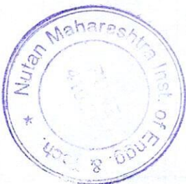
Head of Department Mechanical Engineering

Principal Nutan Maharashtra Institute of Engg. & Technology "Samarth Vidya Sanika" Vishnupuri Talegaon Dabhade, 410507