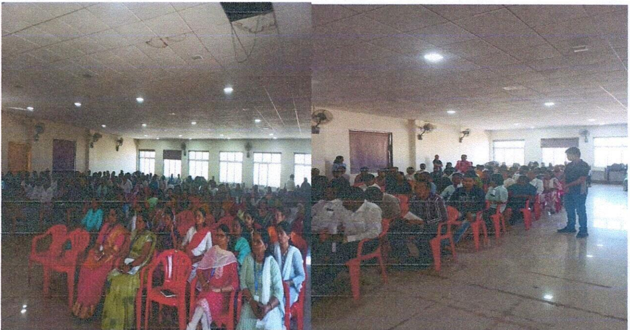
Date: 30/1/2020 Speaker: Alumni Association Activity Session: guidance session on higher education, group discussion and soft skill